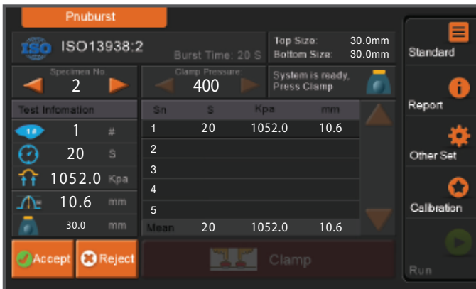
Easy touch screen for running and viewing results