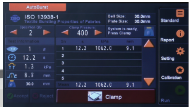
Full-Color Touch Screen