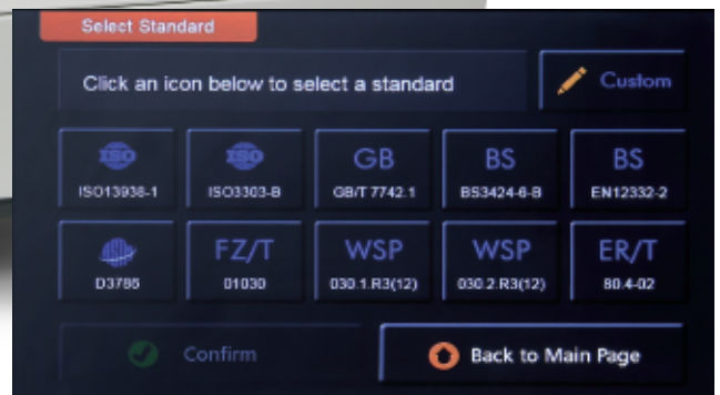
Preprogrammed test routines