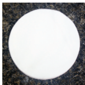
Bursting Verification Fabric

The lifetime of a diaphragm depends on the strength and elasticity of the samples, as well as the test area specified in the test standard. Three types of diaphragm are available to maximize the performance of the PnuBurst and one for the Autoburst.